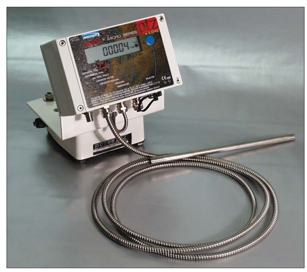
ROOTS<sup>®</sup> Micro Corrector, Model PTZ + Log, ID Mount Version

The ROOTS<sup>®</sup> Micro corrector is part of the new Micro series of electronic products from Dresser. The Micro Corrector, Model PTZ + Log, calculates corrected volume by measuring live temperature and pressure. Supercompressibility is calculated using the AGA 8/SGERG 88 Gross Characterization Method. The unit has logging capability for 35 days of hourly logs, 48 days of daily logs and 15 months of monthly logs, as well as an audit log which records the last 128 changes to the unit configuration. Designed to be the best value in the industry, available in a variety of mounting styles and in several transducer ranges, the ROOTS<sup>®</sup> Micro corrector offers versatility at a competitive price. The Micro Corrector is also available in pressure only and temperature only versions.